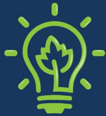
CO 2 Neutral