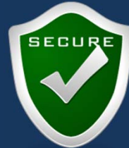
Safe & Reliable