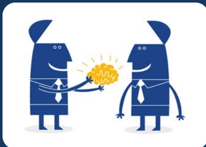
Export of knowledge